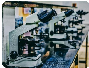
Time Resolved Spectroscopy